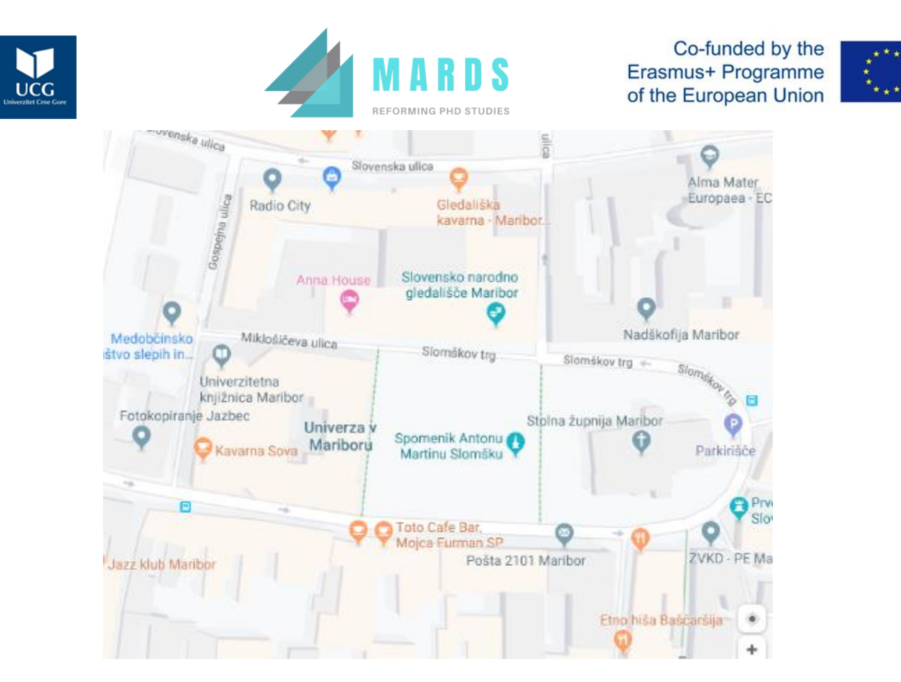
Latitude: 46° 33' 20.39" N