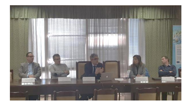
MARDS Promotion on TAM Seminar 19.11.18