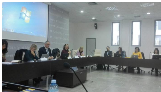
MARDS Presentation on Erasmus+ Info Day 29.11.18