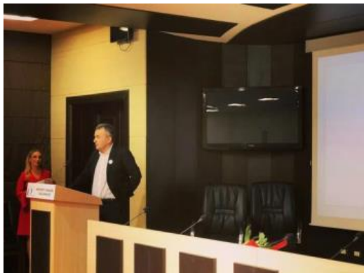
MARDS promotion at Shkoder, 02.11.18