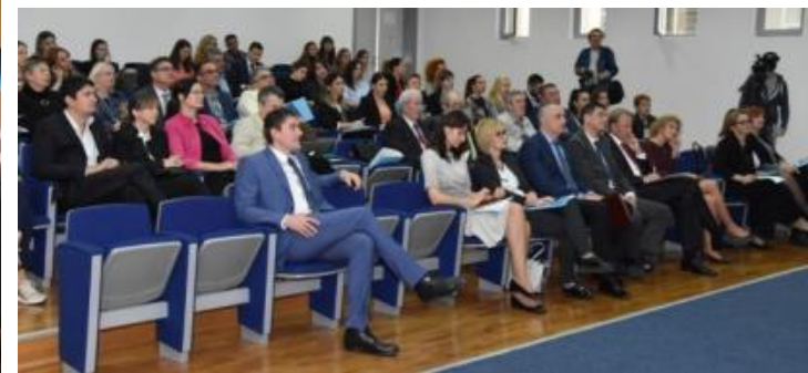
MARDS promotion at E+ Info Day, 13.11.18