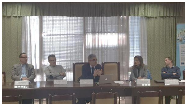
MARDS Promotion on TAM Seminar 19.11.18